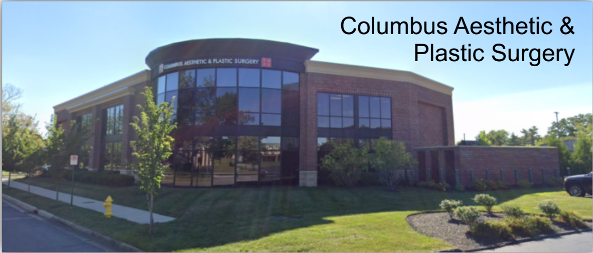
Columbus Aesthetic & Plastic Surgery