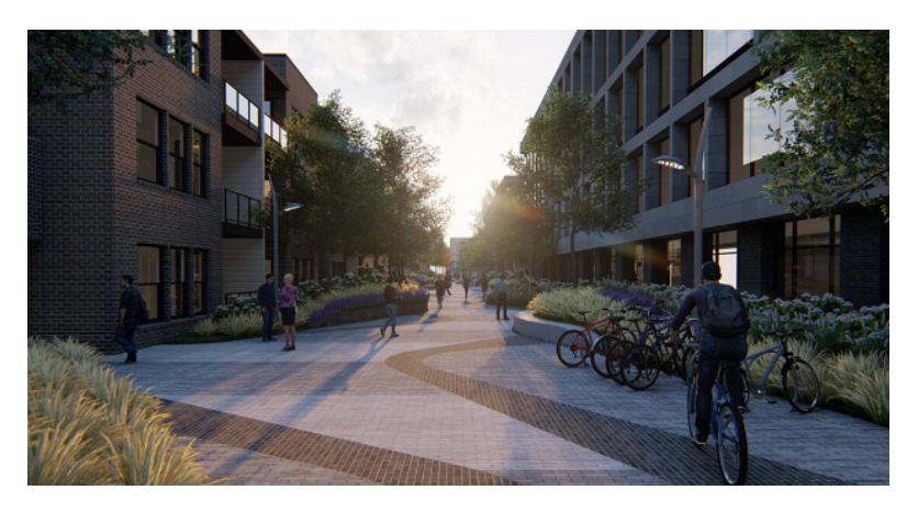
Grandview Crossing 4,545 SF office/acre (across from Sheetz)