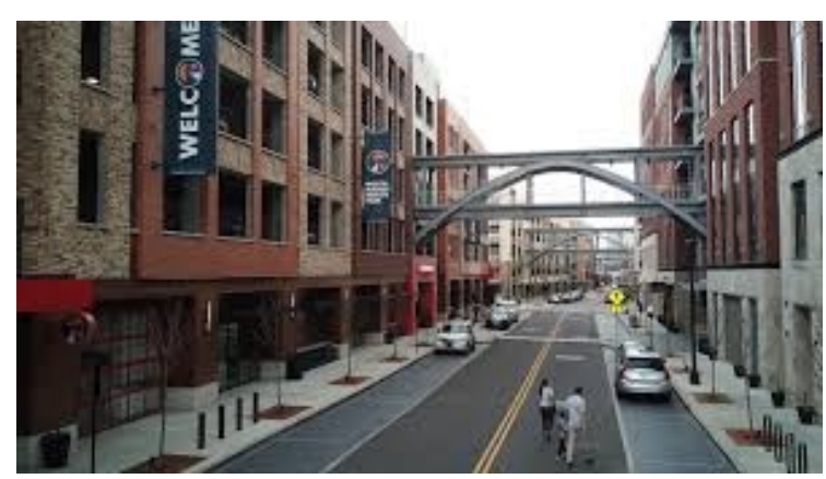
Bridge Park 24,252 SF office/acre (Riverside and SR 161)