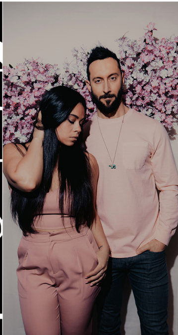
Noon HONEY AND BLUE