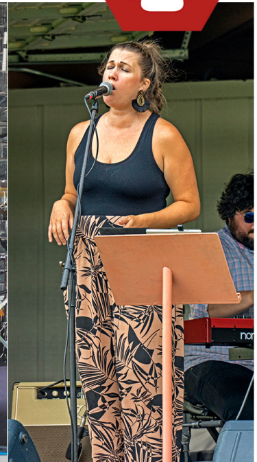
3 PM THE DEEPTONES