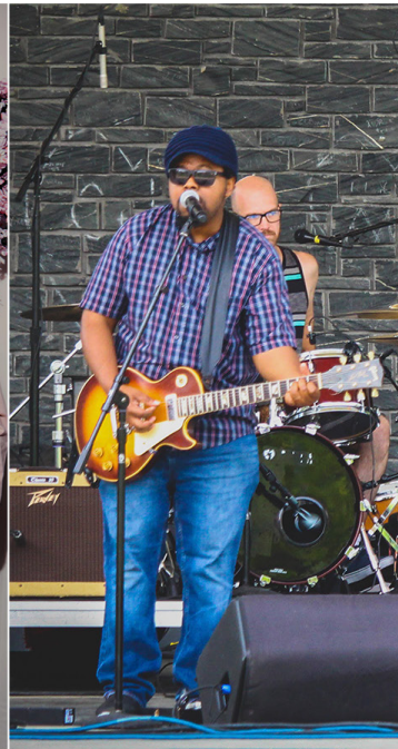
1:30 PM THEO'S LOOSE HINGES