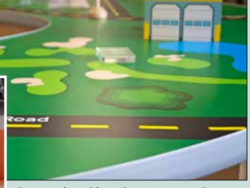
The new play table at the Tremont Road Branch features roads and train tracks winding among familiar UA landmarks.