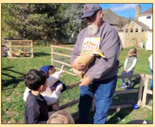
Burbank Early Childhood School learners had an egg-citing time on a beautiful day in November with a special visit from the Farm to You program, thanks to the school PTO.