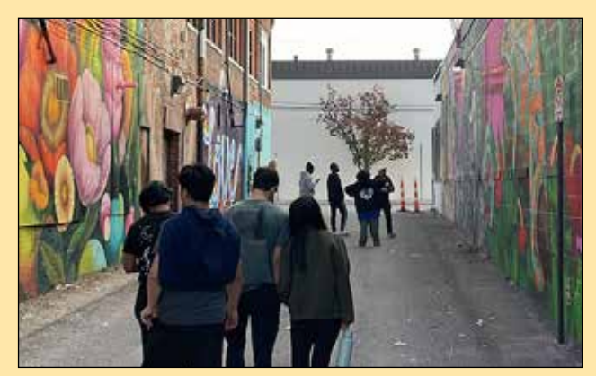
This fall, Upper Arlington High School students took a street art tour with a local muralist, exploring how this artform communicates ideas and connects communities.