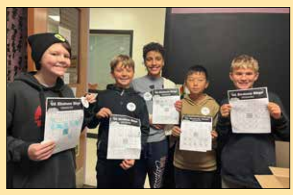
World Kindness Day bingo brought extra kindness into Upper Arlington's schools – including at Hastings Middle School, pictured here.