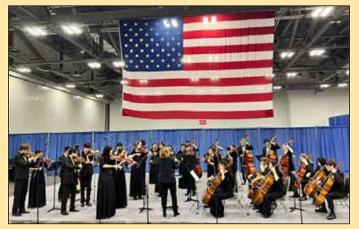
Upper Arlington High School Symphony Strings, pictured above, and the Jones Middle School eighth grade choir shared their talents at the Ohio School Boards Association conference in November.