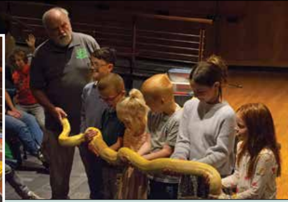
Herps Alive stopped by to introduce young visitors to some new friends.