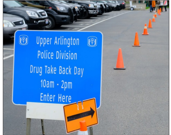
The UA Police Division participated in the Drug Take Back Initiative with a drive-thru event on April 28, collecting 86 pounds of prescription medication.

The UA Police Division maintains a Drug Collection Unit at the Municipal Services Center where citizens can drop off unwanted, unused or expired medications. The Property Custodian is responsible for emptying the box and logging the contents in the Property Room for eventual destruction. The UA Police Division also participated in two Prescription Drug Take Back Days (in April and October) and was able to collect 208.15 pounds of prescription medication.